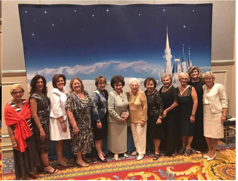
Past Grand Presidents at the Grand Banquet