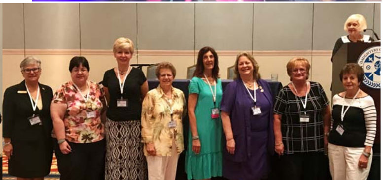
Past Penelope of the Year Recipients