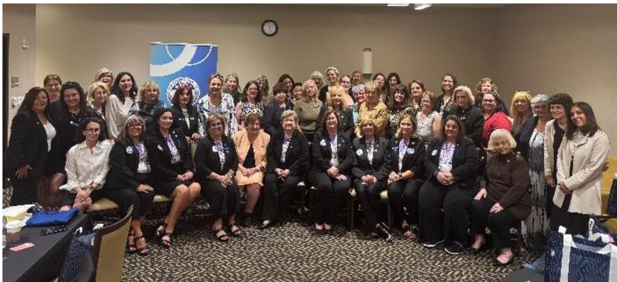
2025 District Governor's Leadership Conference Group Photo